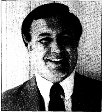
Borzjo Necon (Hello, My Friends),

Even though we are still wrestling over the last one, the next election season is about to begin. At the last Business Committee meeting, we appointed the 1988 Election Committee to supervise the June tribal election. At that meeting we also made several much needed changes in the election ordinance. At every Regional Council meeting we have heard complaints that the time period for requesting ballots and mailing them back was too short. The election ordinance is now amended as follows: