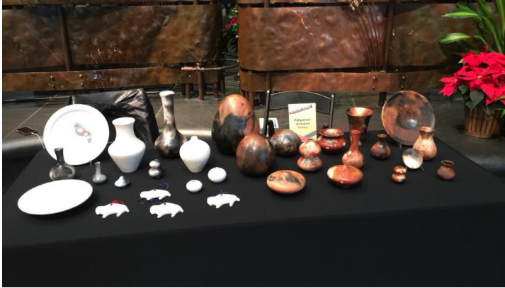
Pahponee's pottery.

Please check my calendar page regularly for newly scheduled events — the treaty tour last weekend came together in just