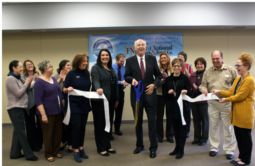
First National Bank & Trust Co. is the first Blue Zones approved bank in Pottawatomie County.

First National Bank & Trust Co. has integrated activities focused on purpose, physical environment and exercise, social network engagement, well-being solutions and leadership into the everyday activities of the bank. FNB has been hard at work implementing such options for its employees.