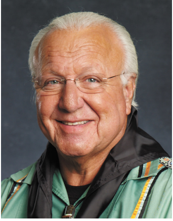
Bozho nikan (Hello my friend),