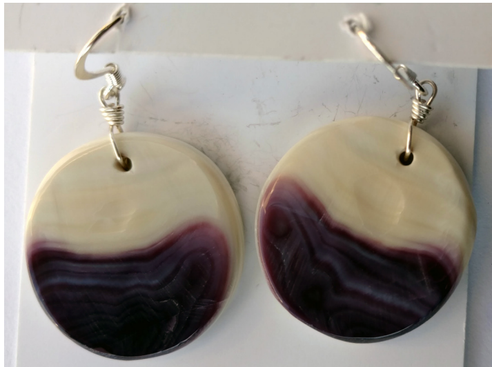
Wampum earrings.

Wampum Wear items are made using quahog clamshells. I have included photos of the clams and earrings as a finished product. When opened and cleaned, they are white with a deep purple coloration that is unique to each one. Once I saw what the source of goods was, it made sense. I have heard the word wampum many times in the past. It is logical to have some kind of transportable “money” since many years ago; our ancestors did not have coins or dollars. They needed something