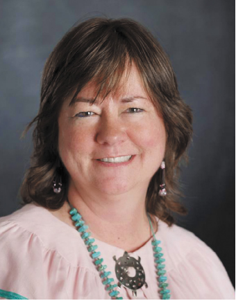
Bozho nikanek (Hello friends),

I wish you a new year filled with peace, good health and good family times. I am hopeful that each of us will gain more knowledge about our Potawatomi heritage and be more giving of our time and talents during 2018. My time serving as a legislator, which started with the start of our 16-member legislature in 2008, has been so personally enriching in a wide variety of ways, including that it has given me the opportunity to meet many dear Potawatomi around the country, from our band and others.