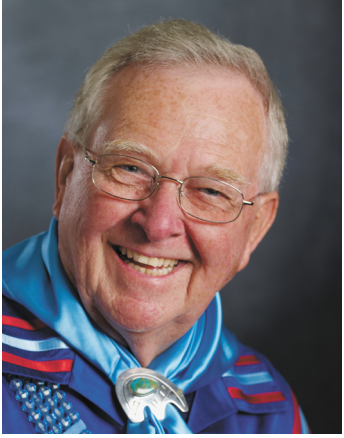
Bozho nikanek (Hello friends),

I hope that everyone had a wonderful and joyous holiday season. As mentioned in my December column, I attended the National Congress of American Indians in Milwaukee in October. At this event, there are always many suppliers and contacts from various areas. I especially like to look at the jewelry and crafts since they come from different nations.