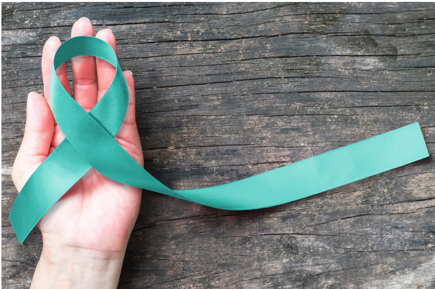
The American Social Health Association (ASHA) and the National Cervical Cancer Coalition have named January Cervical Health Awareness Month to encourage women across the country to get screened for cervical cancer.