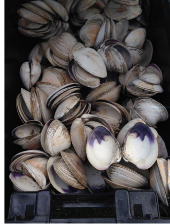
Quahog clamshells. Photo provided

Quahog clams are fairly small. To harvest them, you need to use a tool that is similar to a rake with very long tines. They would wade out into the water with their rake, sometimes almost waist deep, and then press down into the mud and drag the