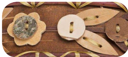
Ojibwe artist Pat Kruse learns and teaches traditional ways.