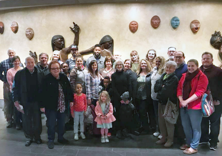
The NMAI tour group.

The same group of folks then met up with another 20 or so Potawatomi family and friends on Dec. 2, for a docent-led tour of the Nation to Nation: Treaties Between the United States and American Indian Nations exhibit at the museum itself. We were able to study the Fort Wayne Treaty of 1809, which is part of the