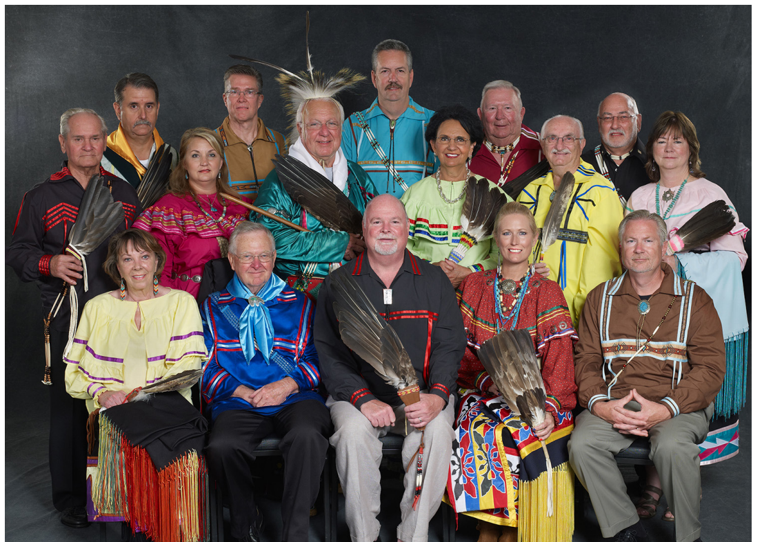
The Citizen Potawatomi Nation Legislature.

As Honoring Nations Harvard projects have