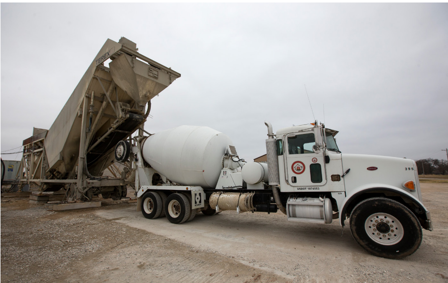
A cement mixing truck sits ready for distribution and automation tests at the recently reopened Tribal batch plant in Shawnee, Oklahoma.

“It really is a pretty simple process,” Beach said. “It’s all calculation;