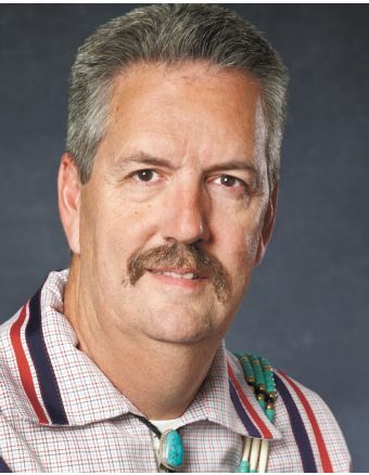
Bozho nikanek (Hello friends),

The arrival of the New Year always gives us all a chance to reflect on the past and to look forward to the future. I for one, am glad to see 2017 go. Too many parts of our country have suffered loss, as have our members. From tornados and hurricanes to floods and fires, it seemed