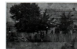
Title: Bertrand Photographs Date: 1900s